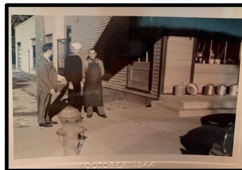
Tisserat Building as Gerstner Hardware and Chrysler-Plymouth Agency, October, 1944.