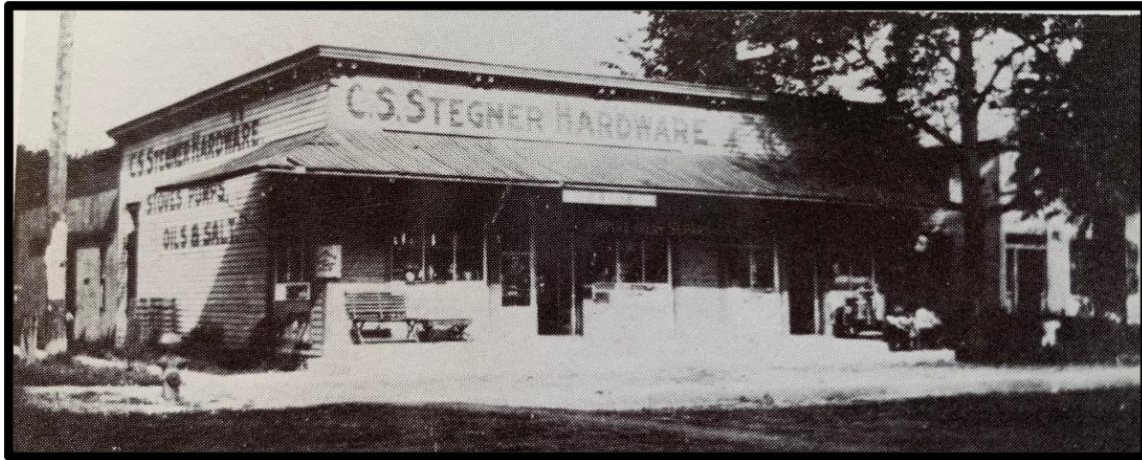
The Tisserat Building when it became Stegner Hardware, 1907