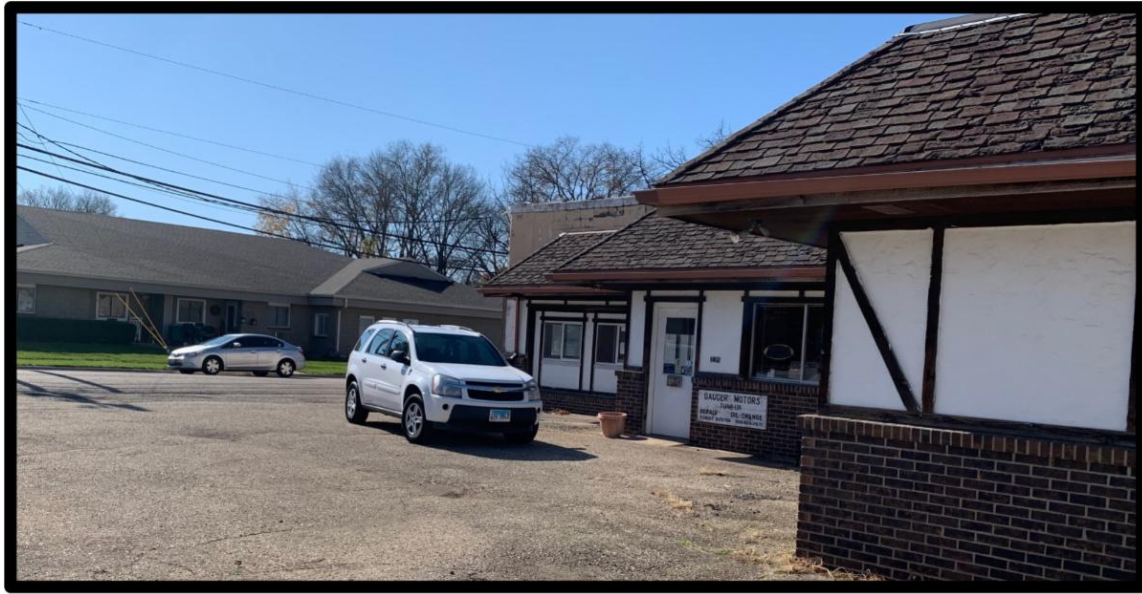
The Tesserat Building, after many alterations, as Gauger Motors, Fall 2022